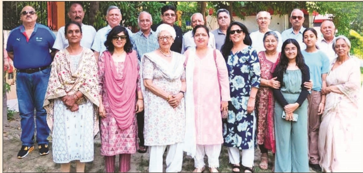
MS Noida Monthly Meeting on 6 Oct 2024