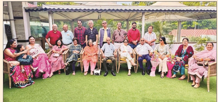
MS South Zone Monthly Meeting on 13 Oct 2024