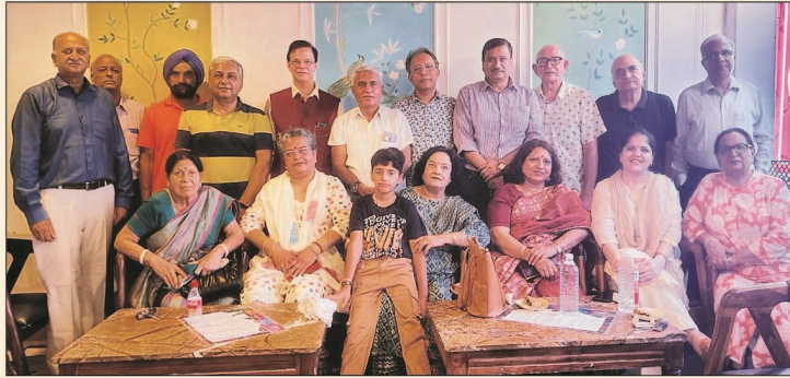
MS Jaipur Monthly Meeting on 29 Sep 2024