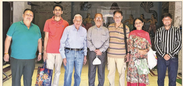
MS Janakpuri Monthly Meeting on 6 Oct 2024