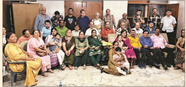
MS West Zone Monthly Meeting on 2 Oct 2024