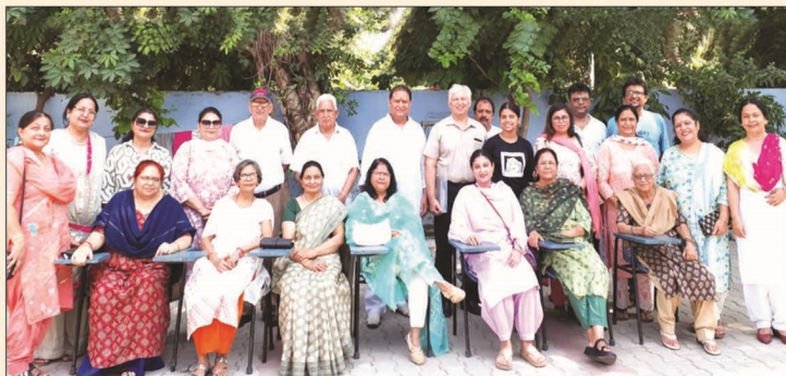
MS Gurgaon Monthly Meeting on 6 Oct 2024