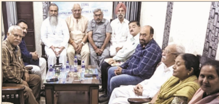
MS Mohali Monthly Meeting on 13 Oct 2024