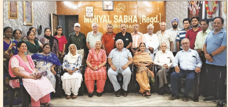
MS Faridabad Monthly Meeting on 6 Oct 2024